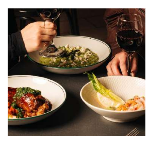
V - VEGETARIAN

Select 2 entrées, 2 mains and 2 desserts for your guests. We will serve your choices "share style" on the day.